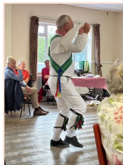
Two photographs from the Social event that took place in July.

If you wish to contact anybody who is mentioned but is not listed as a Group Organiser, please use the "contact page" on the website, The message is then passed on to them.