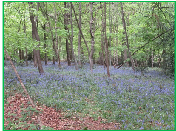
Bluebells at Foxholes reserve, Bruern

Our outdoor meetings continued with trips to Foxholes near Bruern, where we found a fine show of Bluebells and heard a Cuckoo calling, and Clattinger Farm, a (rather rainy) Wiltshire Wildlife Trust reserve. Later on we visited Butterfly Conservation's Bill Smillie reserve near Cleeve Hill, which held considerably more butterflies than last year's cold visit. Kiftsgate Court Gardens was our August trip.