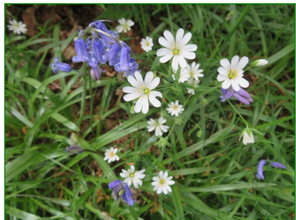
Bluebells & Stitchwort